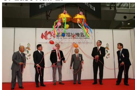
Opening of the Decorative Ball "Kusudama"