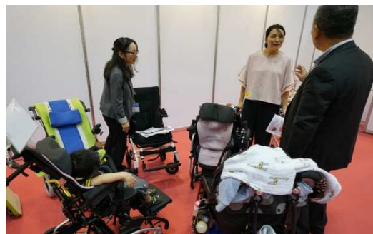
Kid's Square, Special Site C